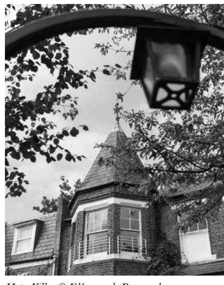
Hope Villas

And the list goes on. You'll find the current one on the Canonbury Society website. The project will culminate in October with a website portraying each of Islington's local listings to celebrate our heritage and ensure the legacy of these buildings is understood and cherished when new developments are proposed and planning decisions are taken.