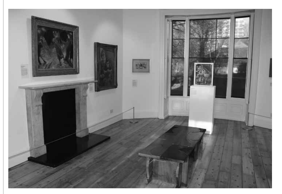
New-look Estorick Collection, bright and airy throughout.

Contact www.estorickcollection.com, or ring 0207-704-9522.