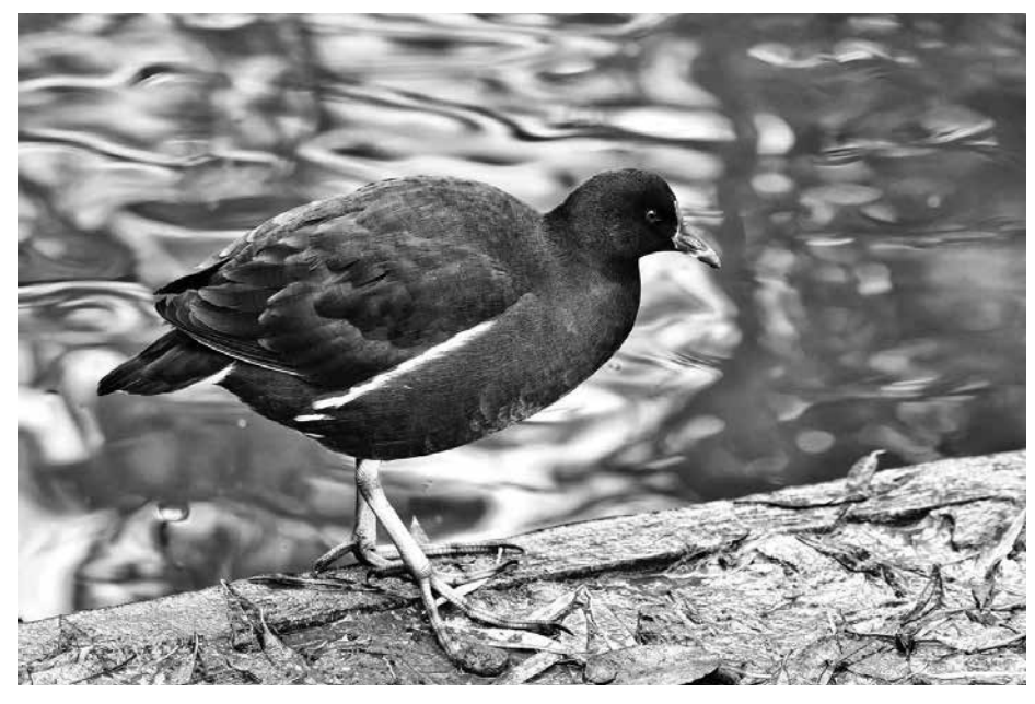
A moorhen on the New River

The temporary restraints carried out to parts of the listed cast iron railings following the 2009 Structural Survey (funded by C.I.L. monies and The Friends of the New River Walk) are still doing their job and will have to remain until money can be found to make a start on the permanent repairs recommended by the survey.